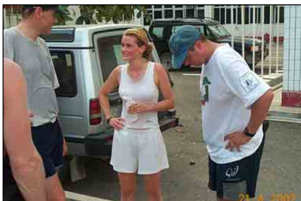
What's the points???