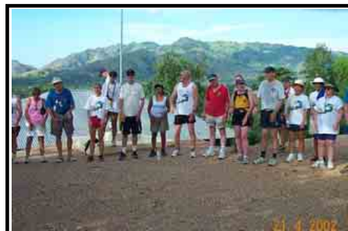
The walkers taking another break.

The start of the climb was hazardous as the walkers had to negotiate a stone fence and a ferocious barking dog that was locked away in a shed. But conveniently, there was some safety ropes in place to allow the walkers to steady themselves while they negotiated the fence. Gee WARTHOG thinks of every thing doesn't he? However it wasn't until UNTAET got the repair bill on Monday morning that it was realised that the safety ropes were not safety ropes but was someone's clothesline that eventually fell to the ground from the use.