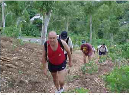
The photogenic hair hare from his best angle

Out on to the run On On through the back yards of the village Hashers going in all directions until at last Jacko showed them where to go. We stopped at a Hold Check near a statue that was pointing it's finger in a south-easterly