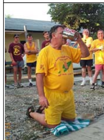
How could such elegance get "Worst Dressed of the Year?!"