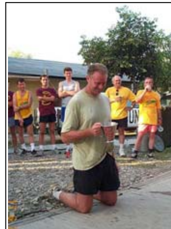
PS wondering whether he should drink it and leave or just stay in ET for good

Reality is an illusion that occurs due to lack of alcohol. Anonymous