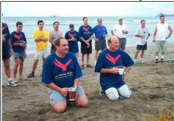
Anything but an AS Whole of a venue!

POTW EJACULATION for trying to grease the GM before the Circle (though doing it at any time would be the same.)