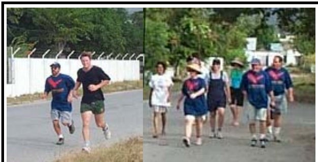
Proof that we do have runners and walkers!

The verdict on the run was that the company was excellent. But you've got to give credit to the fact that DRIBBLER and DEEP THROAT actually spread some flour round the streets of Dili for us to follow. Maybe it was done half an hour before the run started and maybe it was done from a car but at least they made the effort. What about some more volunteers?