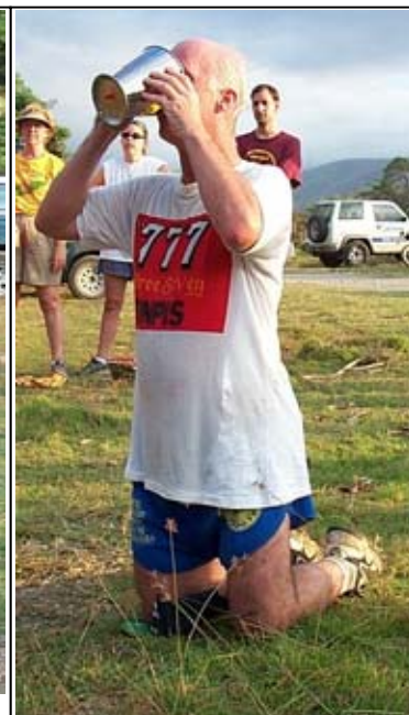
FIRST TO 50! SCRUBBER celebrates with Rum & Coke.