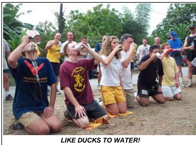
LIKE DUCKS TO WATER!

TEAMWORK...means never having to take all the blame yourself.