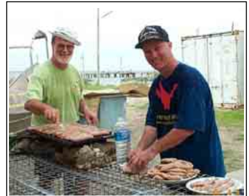
Santa's little helpers