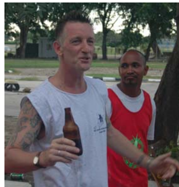
Did I really see that up his shorts?