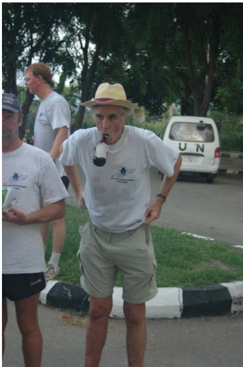
I wonder if this would remove a tooth?