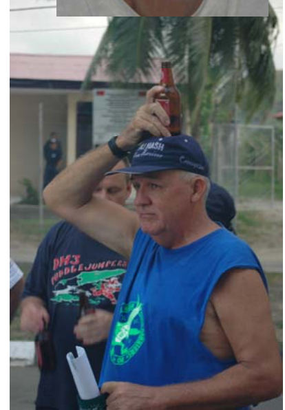
You got me, it's a fair cop