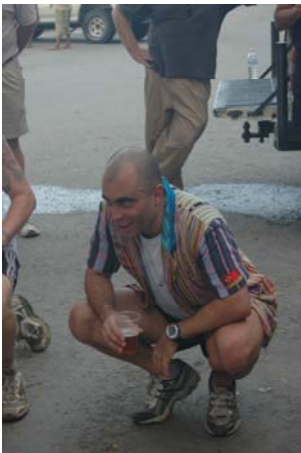
Anyone mind if I squat?