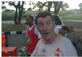
↑ Did I just see that up his shorts? → Yes, tooth removed and it didn't hurt at all, must be the beer...