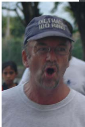
I know Jack Shit, personally.