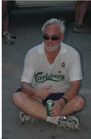
Officer, it was him...