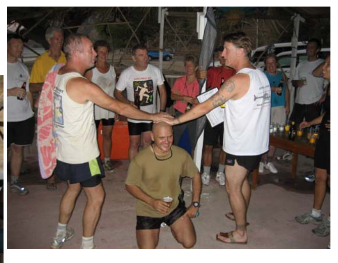
Now we know who's been causing all the trouble – Rock Chucker!

→ Eliminator on the case, adding the facts about Tight Ass & Mudflap.