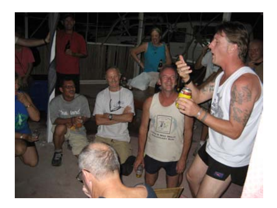
Half the Mis-management team are charged