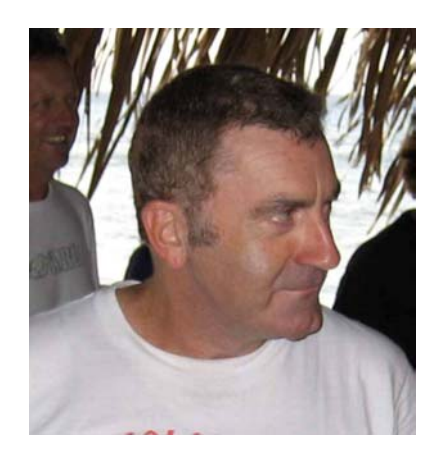
Shocked, or jealous?

Hashers gain valuable insight into the arts of mountain camouflage