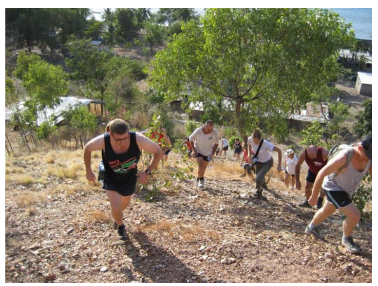
Up, up, and away. My god, I can see stars from up here...