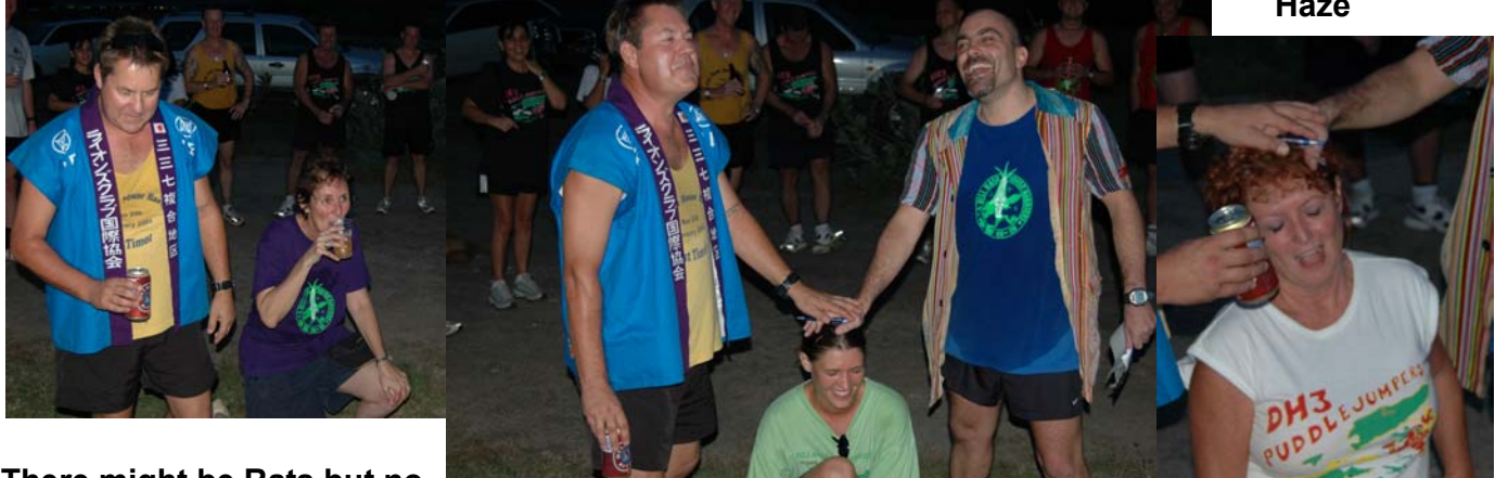
There might be Rats but no roaches on this Hash