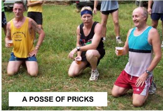
A POSSE OF PRICKS