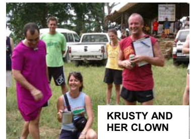
KRUSTY AND HER CLOWN