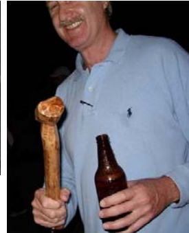
OH FOR A 3RD HAND!