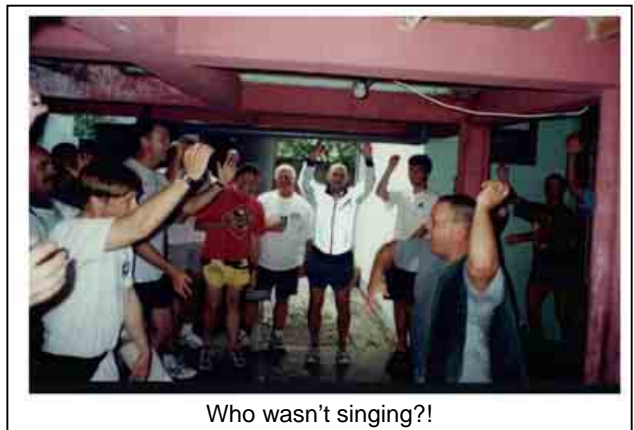
Who wasn't singing?!