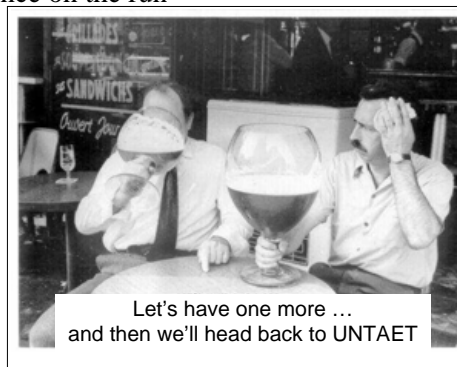
Let's have one more ... and then we'll head back to UNTAET

POTW (Back at last!) To BROWN EYE by our a/GM apparently for not making sure that MAPLE TURD sang in the Circle last week but later it was apparent that our clairvoyant leader had realised that there was something else special about BROWN EYE this week. It was discovered later that our latest POTW holder was silently celebrating his 62 nd birthday on that very day!