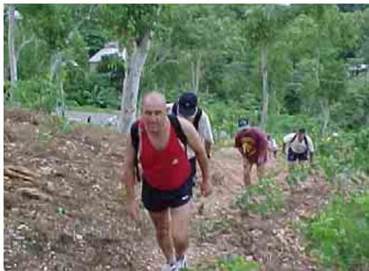
The photogenic hair hare from his best angle

Out on to the run On On through the back yards of the village Hashers going in all directions until at last Jacko showed them where to go. We stopped at a Hold Check near a statue that was pointing it's finger in a south-easterly