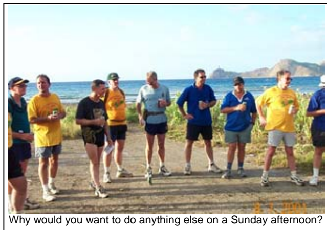
Why would you want to do anything else on a Sunday afternoon?

A. It's one of those "evolutionary things" that allows them to stand closer to the kitchen sink.