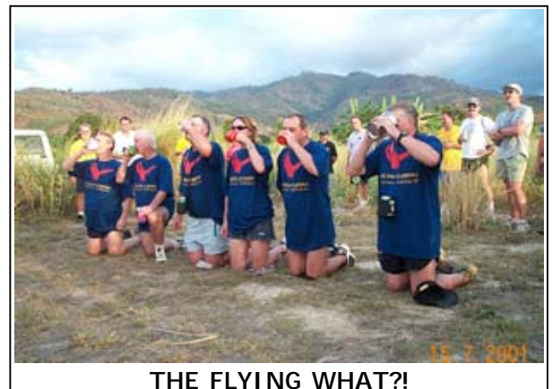
THE FLYING WHAT?!

After an abridged 'Father Abraham' the runners negotiated their way through a workers' housing complex before joining the walkers for a gentle amble across the recently harvested paddy fields before being presented