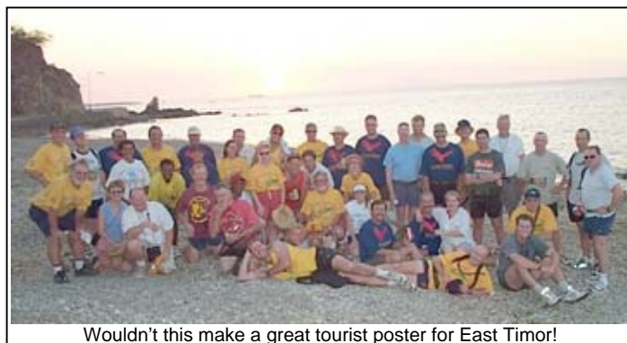
Wouldn't this make a great tourist poster for East Timor!

EJACULATION was up front with his horn, as were the usual FRB's, but they were disappointed upon finding that the run had few bushes in which to frig off behind before the other runners had a chance to catch up with them. The horn was only momentarily silenced as the runners found themselves inside a fences compound with the trail clearly marked on the other side of the high fence. But, like all true hashers they didn't let a little thing like a high fence stand in their way and, with no more than a quick visual check, it was up and over and on their way. The first Hold Check was up a pissy little hill, not even as far