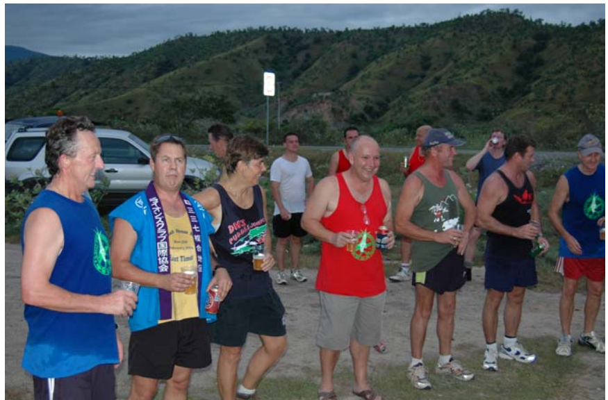
Whatever it was, we know they deserved it...

And On On to Run 314, the Stains Hacienda, complete with tractors, manure heaps, and fresh bangers. At the start of the circle, the Run Hare was heard to say "there are a few small hills". Given the surroundings no one was convinced.